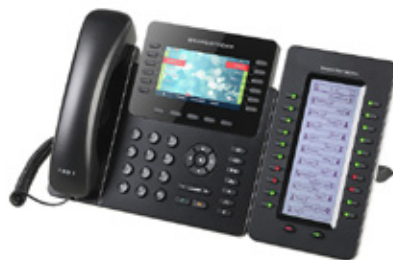
Expandable switchboard accessories