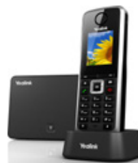
Add on cordless phone for workshop or warehouse