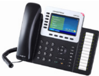
Customisable live online screen

Connection fee applies. Final package price depends on accessories selected. Terms and conditions apply. Volume discounts available. Contact our friendly team for more information.