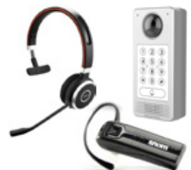
Wide selection of other accessories

We Provide Cloud Computing, Hosting, VoIP and Data Centre services along with other managed (and unmanaged) ICT related services.